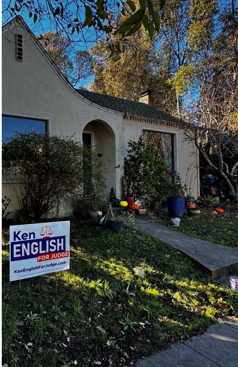
Photo of Sign Located at 1512 16 th St., Santa Rosa