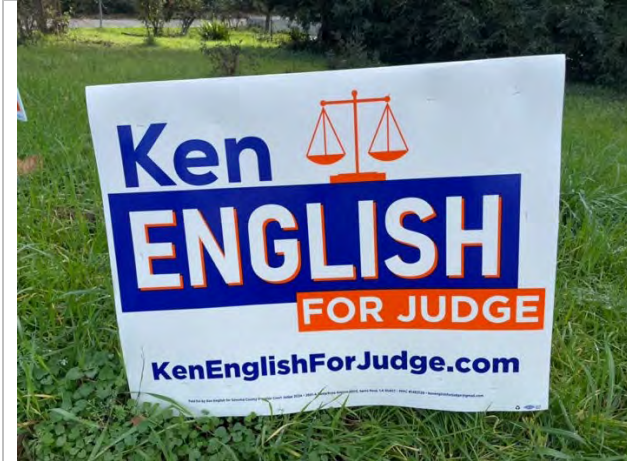
Photos of Sign Located at Franklin Ave. & North St., Santa Rosa